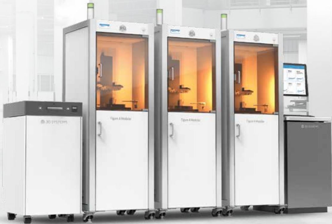
Figure 4 Modular is a scalable, semi-automated 3D production solution that grows with your business, enabling capacity to meet your present and future needs, up to 10,000 parts per month, for unprecedented manufacturing agility.

Scalable, semi-automated 3D manufacturing solution designed to grow with your prototyping and production needs