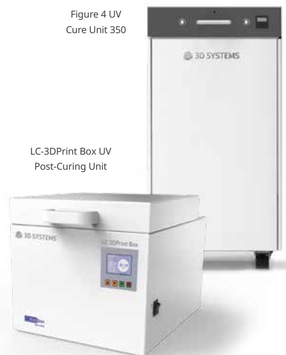
LC-3DPrint Box UV Post-Curing Unit